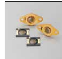
High Power Illuminator