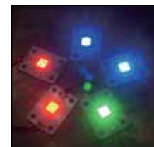
For Horticulture Lighting