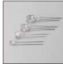
LED Plastic Mold