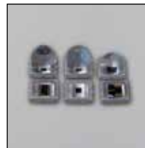
High Power SMB