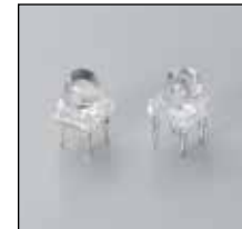
Super Beam Type LED