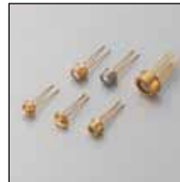
Stem Type LED