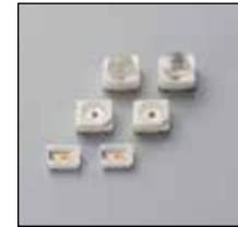
Surface Mount Package