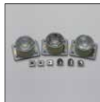
SMB with Outer Lens