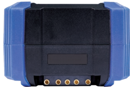
2.1 Pin Socket