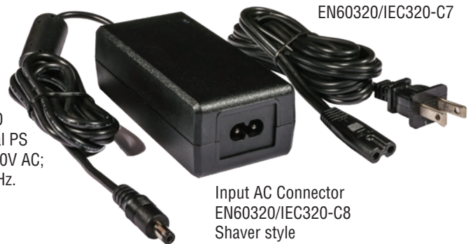
Output DC Connector 2.1mm x 5.5mm x 9.5mm

UPS-00 External PS 100-240V AC; 50-60 Hz.