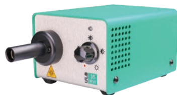
1004233 ULB-35rvi2 Machida Adapter

Input AC Connector EN60320/IEC320-C8 Shaver style