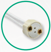
LAMP SOCKET Use with C-14B socket Ordering Code 1000109