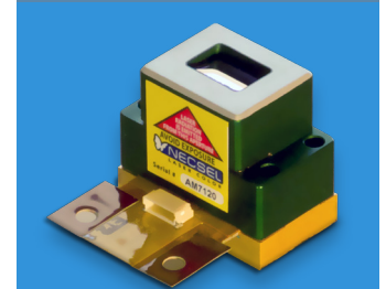
GREEN 532/550 LASER