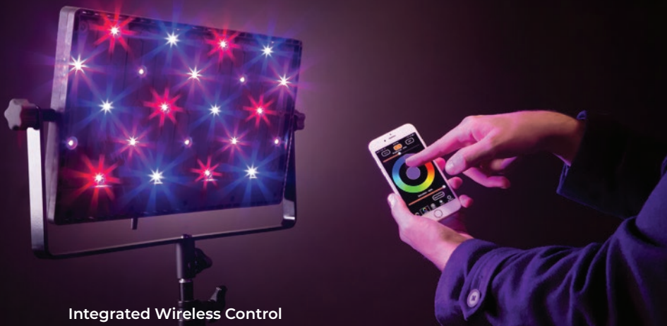
Integrated Wireless Control